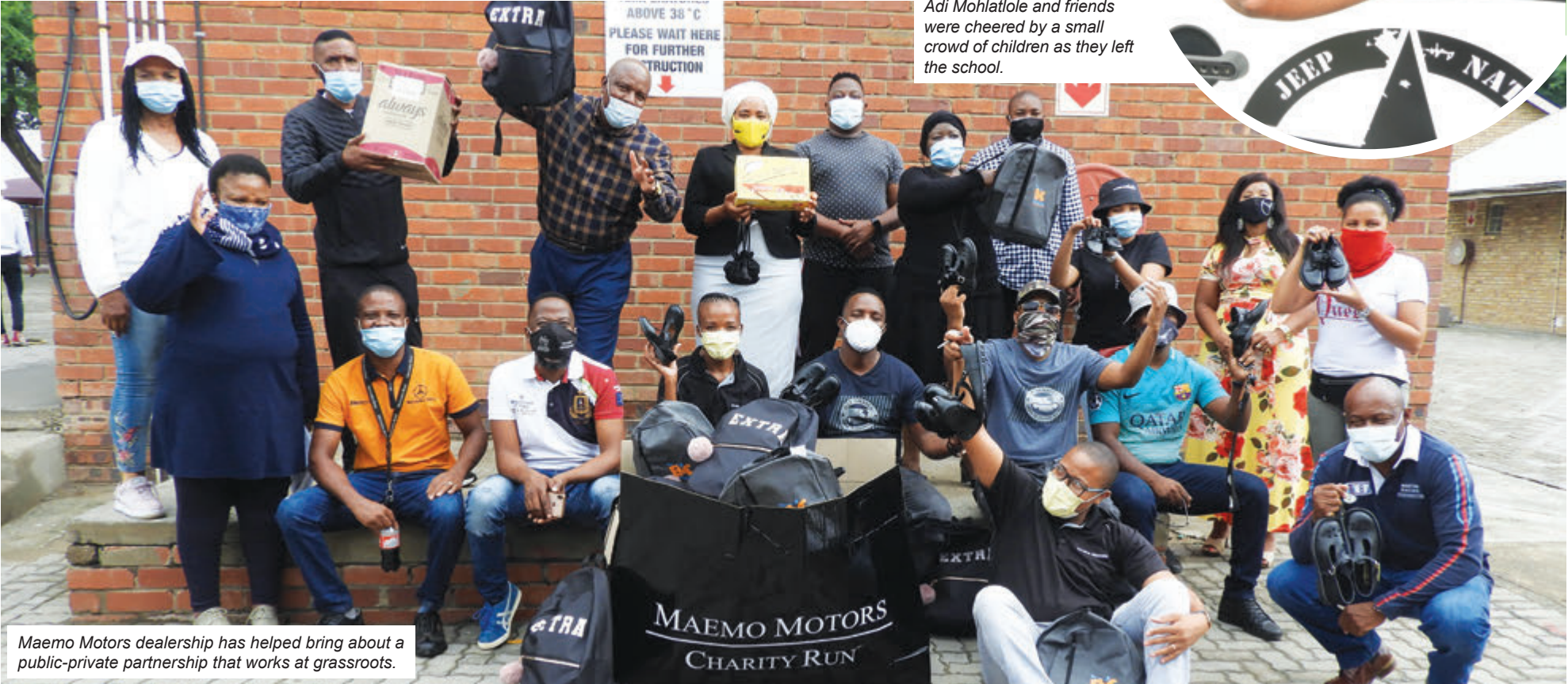
Maemo Motors dealership has helped bring about a public-private partnership that works at grassroots.