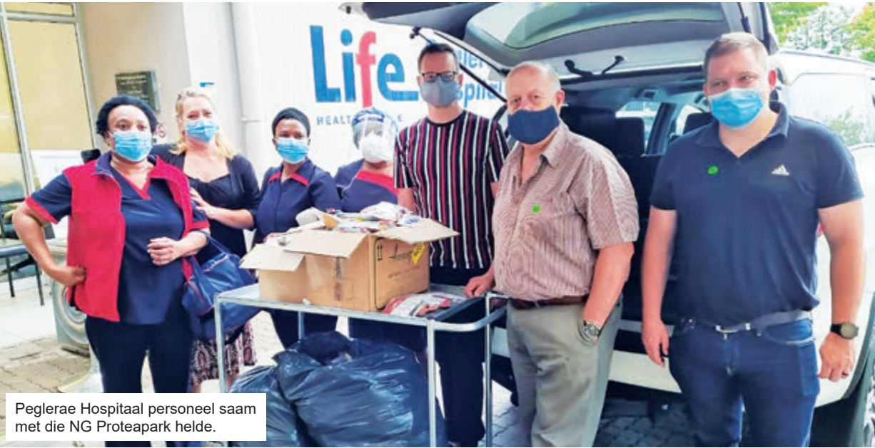
Peglerae Hospitaal personeel saam met die NG Proteapark helde.