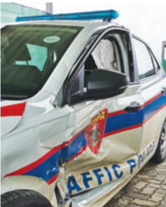
Traffic police vehicle took a knock.