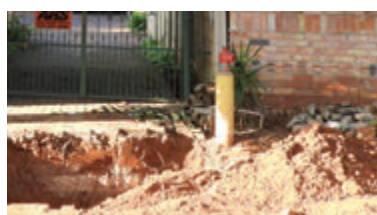
A resident of Santolina Avenue could not go to work for three days as the RLM has left a hole in his driveway on 7 February.