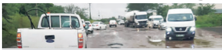
Just another day of potholes along Mangaan and Quartzite streets on [photo: 2 February].