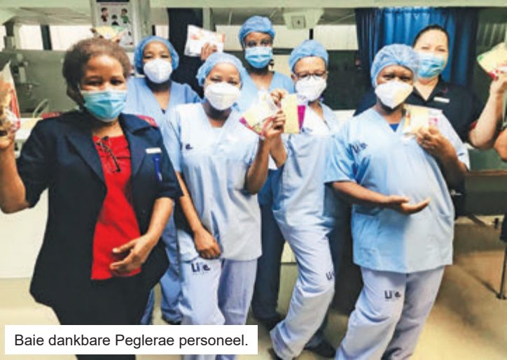
Baie dankbare Peglerae personeel.