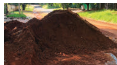
Another untidy excavation on the corner of Safari and Azalia avenues to attend to a leak that keeps on re-occurring on 10 February.